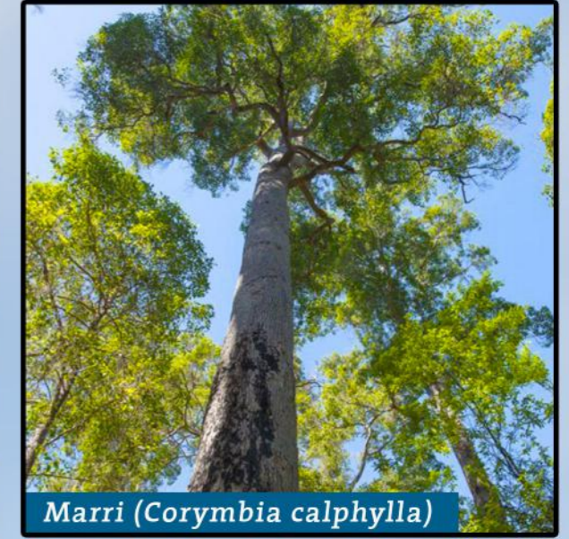
Marri ( Corymbia calophylla )