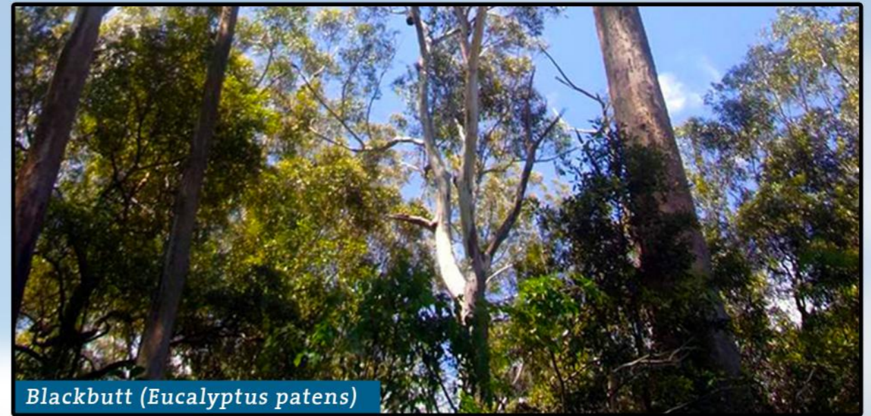
Blackbutt ( Eucalyptus patens )